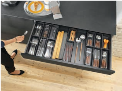
AMBIA-LINE for cutlery