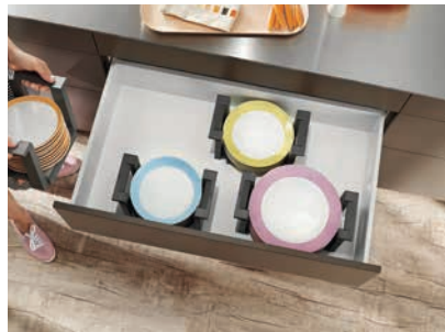
AMBIA-LINE plate holder