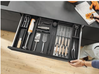
AMBIA-LINE knife holder