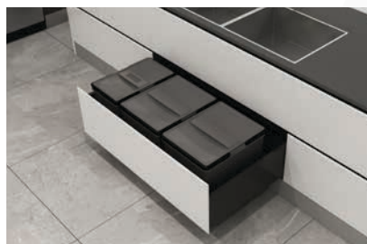
34. Kia Ora