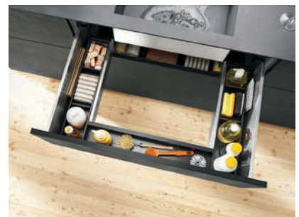
AMBIA-LINE for cleaning utensils