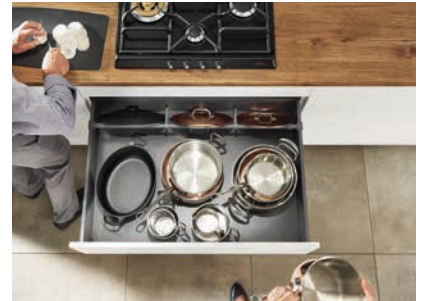
AMBIA-LINE for pots and lids