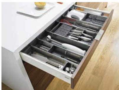
Flexible utensil dividers