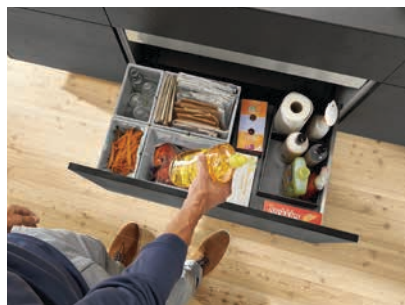
AMBIA-LINE for waste separation