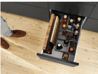
AMBIA-LINE for bottles and cutting boards