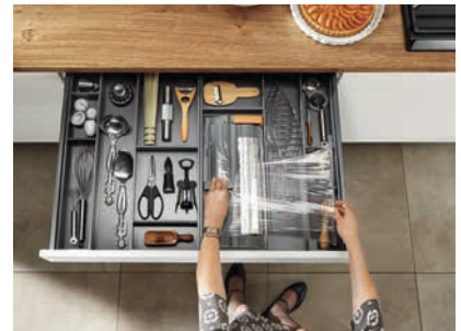
AMBIA-LINE foil/film dispenser