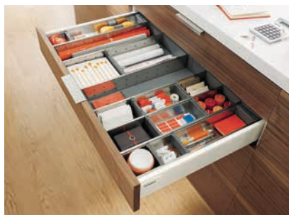
Flexible cutlery dividers

ORGA-LINE sets with high-quality stainless-steel trays and/or utensil dividers are available in nominal lengths from 450 to 650mm.