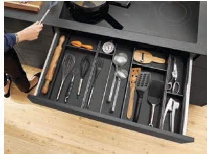
AMBIA-LINE for kitchen utensils