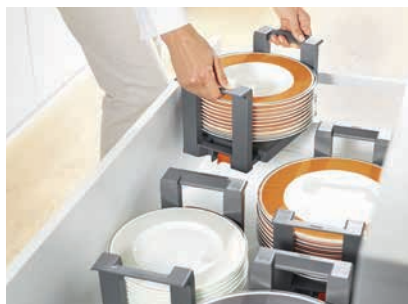
Blum plate holder